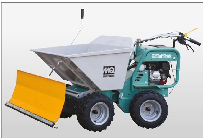
TuffTruk Snow Plow — TSP — perfect for displacing snow during poor weather conditions.