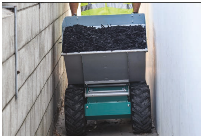
Optional 7 ft 3 clip-on tub — TT7 — allows access through narrow 32-inch passageways.