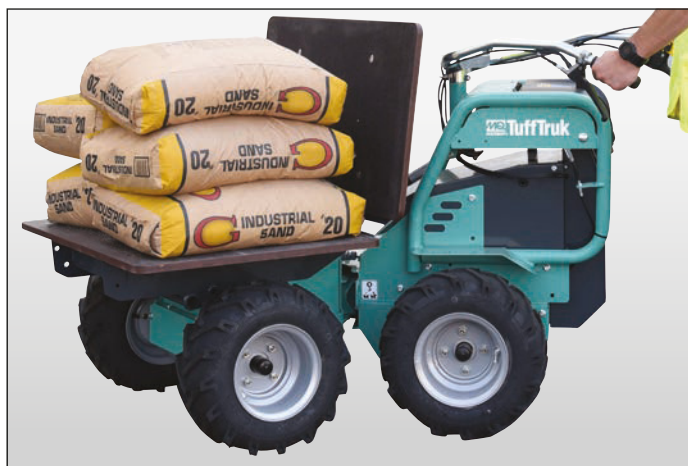
TuffTruk Flatbed — TFB33 and TFB29 — 33.4 or 29.0 inch width, ideal for transporting heavy bags of material.