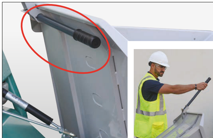
TuffTruk Dump Handle — TTH — for added convenience when discharging tub uphill.