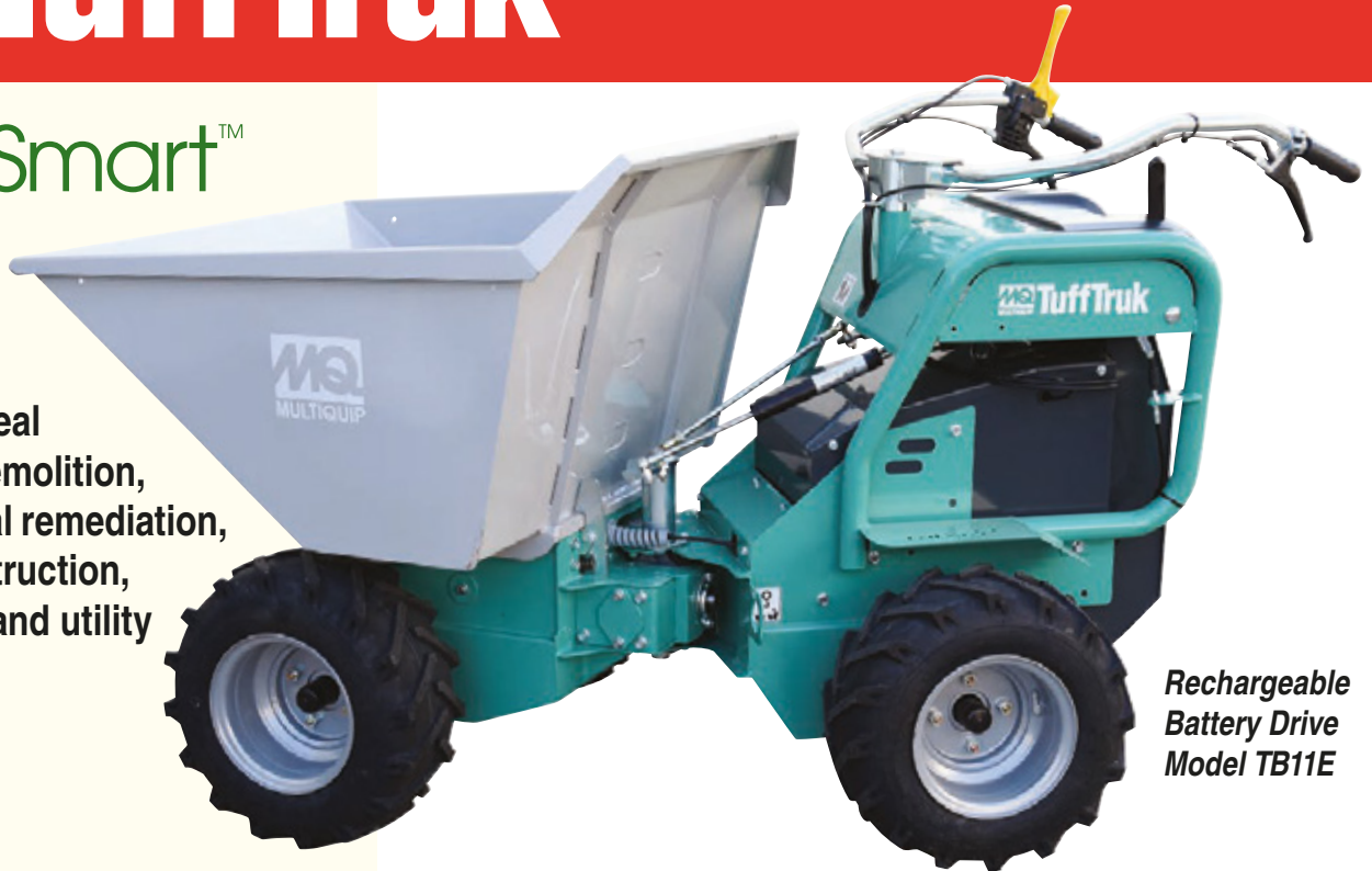
Rechargeable Battery Drive Model TB11E

The compact TuffTruk is ideal for interior demolition, environmental remediation, general construction, landscaping and utility work.