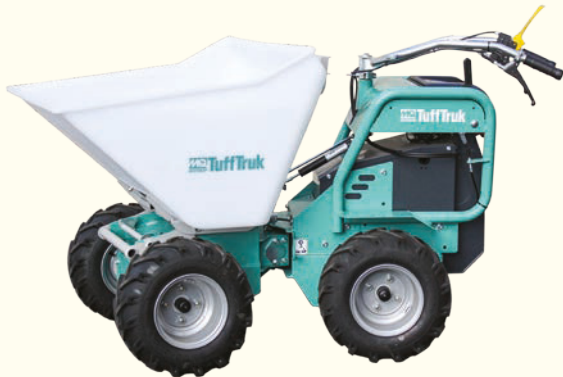
Available with a Polyethylene Tub