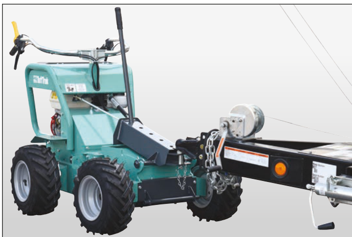
TuffTruk 2-Inch Towing Hitch — TBH — offers various height positions for different size trailers.