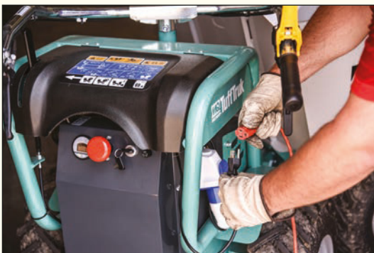
Integral battery charger uses standard 120 Volt power and features overcharge protection.