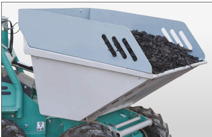
TuffTruk Extension Kit — TTE — 33.4 or 29.0 inch width, ideal for increased capacity when carrying light loads.